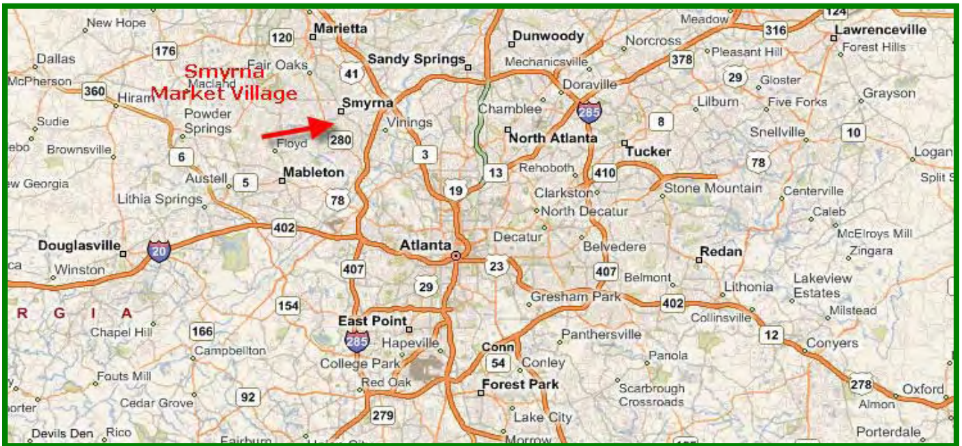
Map Information: Smyrna is located 10 miles from downtown Atlanta and is strategically located near three interstate systems; I-75, I-20, I-285; and US Highway 41, a major arterial roadway. The city is conveniently located less than a 30 minute drive from Atlanta's Hartsfield Jackson International Airport.