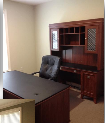
Private Offices with Windows